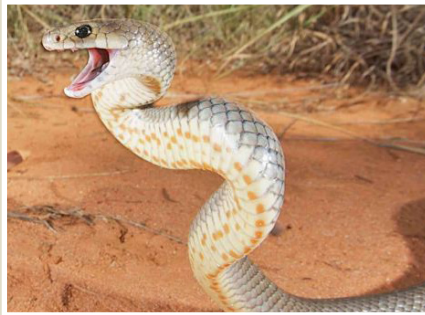
Western brown snake (Pseudonaja mengdeni)