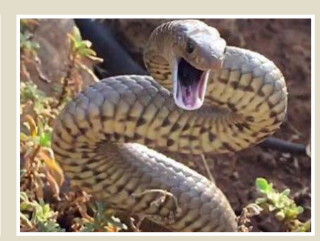
Mainland tiger snake (Notechis scutatus)