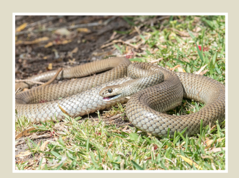
Eastern brown snake (Pseudonaja textilis)